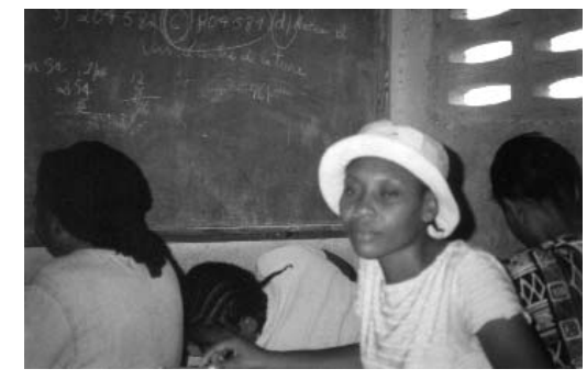
Children are taught in the mornings. Adults learn to read and write in the afternoon!