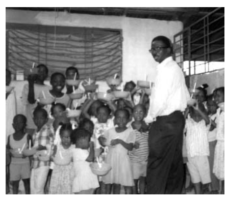
"He that hath pity upon the poor lendeth unto the Lord;" Proverbs 19:17