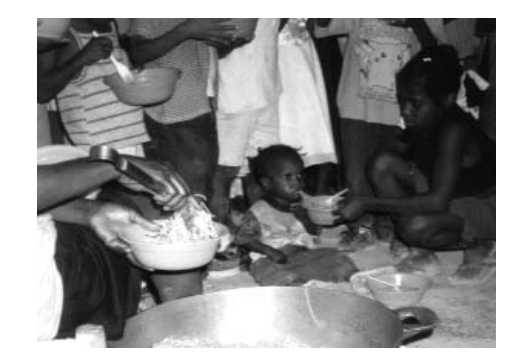
A child fed is a life saved!

Editor's Note: Please overlook any poor grammar or spelling in the above letter. I wanted to share the note from this great pastor in his own words.